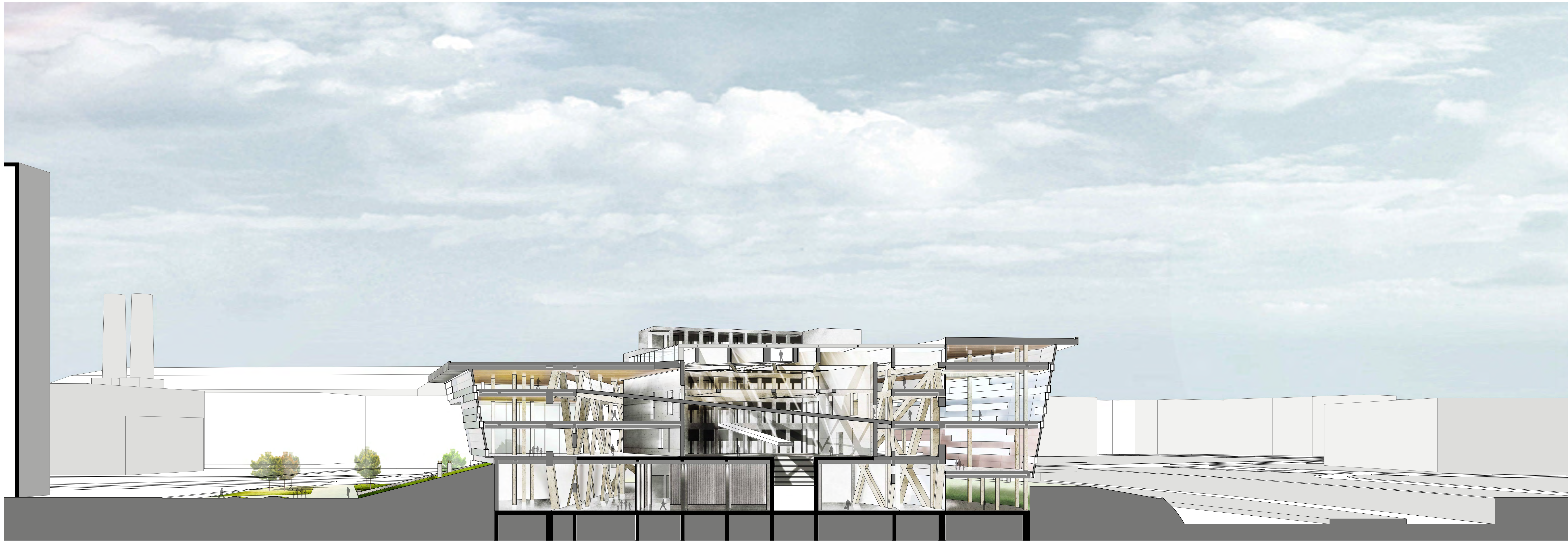
SECTION A ' SCALE: 1/16" = 1'-0"