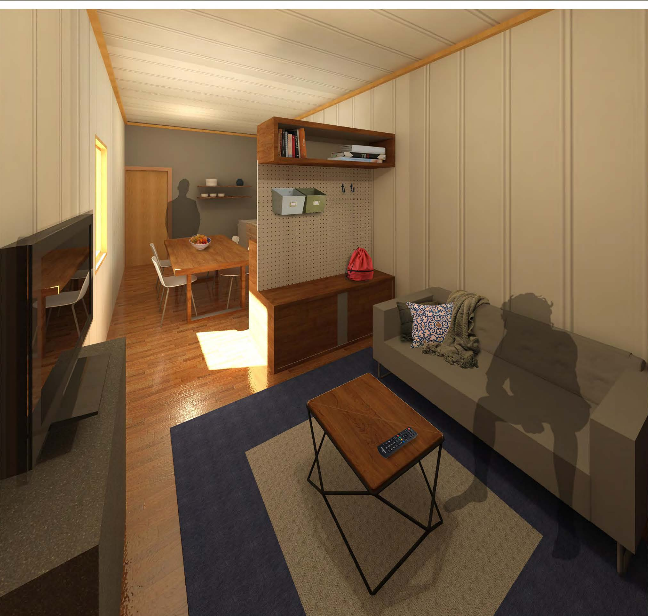
Interior of the living room and kitchen space in Home C. The room divider is used to provide privacy between the two distinct spaces as well as provide flexible storage.