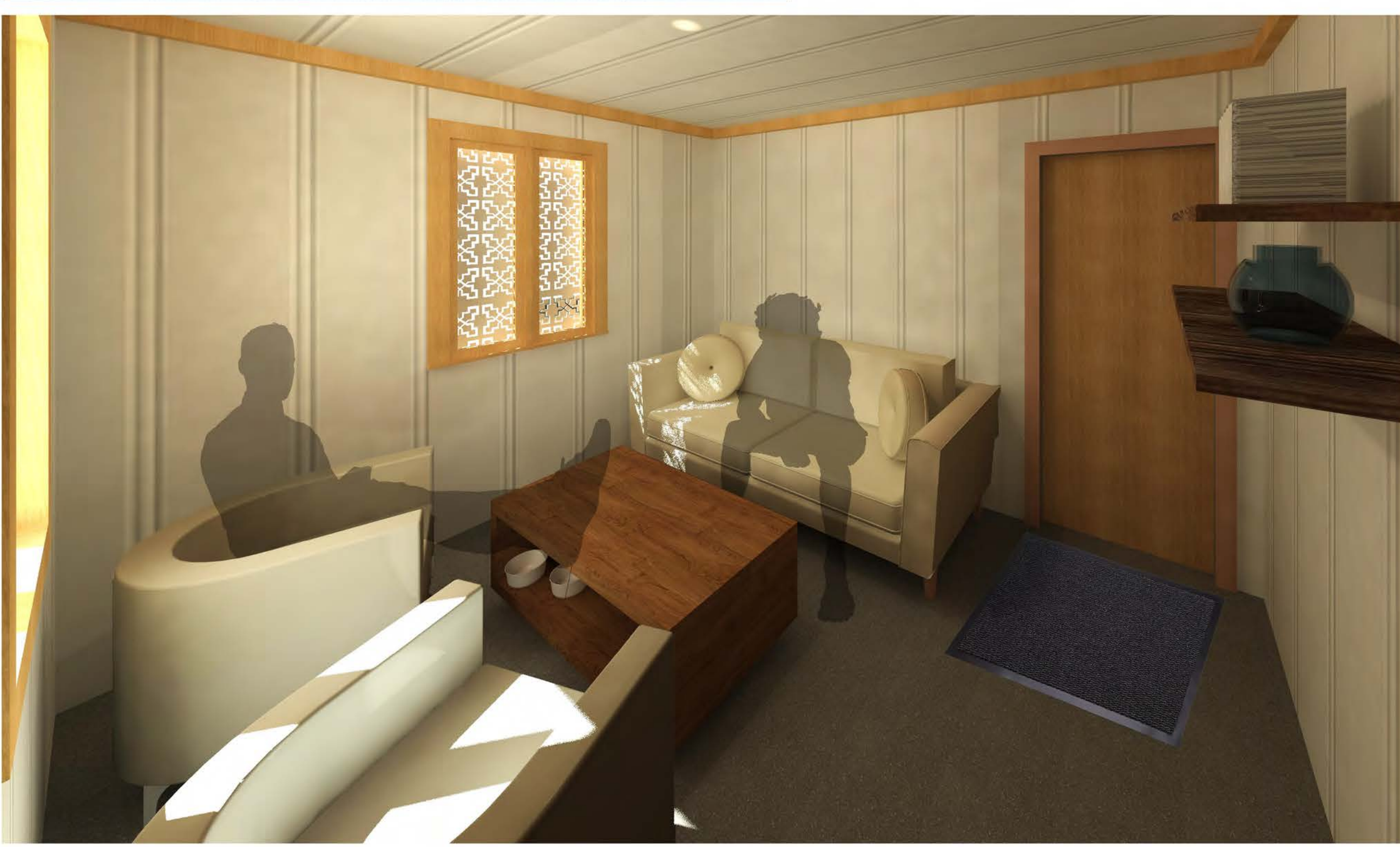
Interior of the salon in Home C. This includes shelves on the structural wall, comfortable seating, and a mosaic metal window covering.