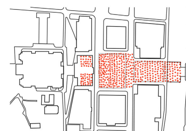
OCCUPATION DURING THE EVENTS