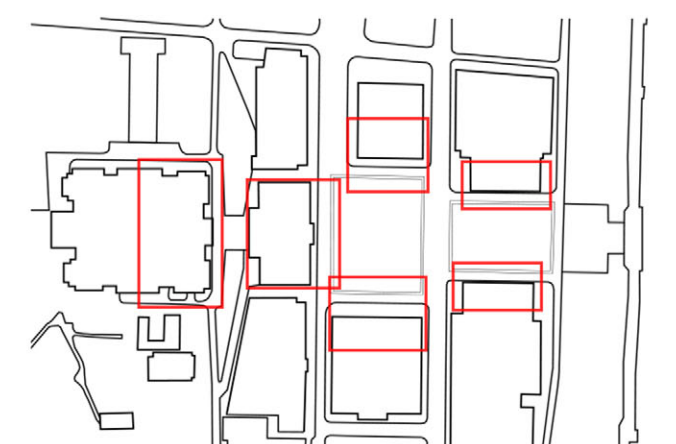
VISIBLE PROPORTION OF THE SURROUNDINGS IN THE SQUARE