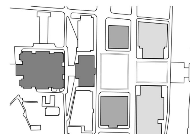
ARCHITECTURAL HIERARCHY OF THE CONTEXTS