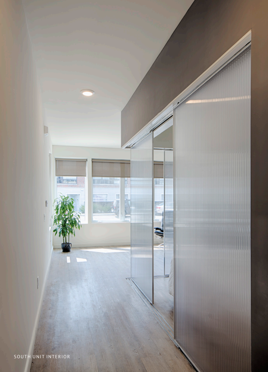
SOUTH UNIT INTERIOR