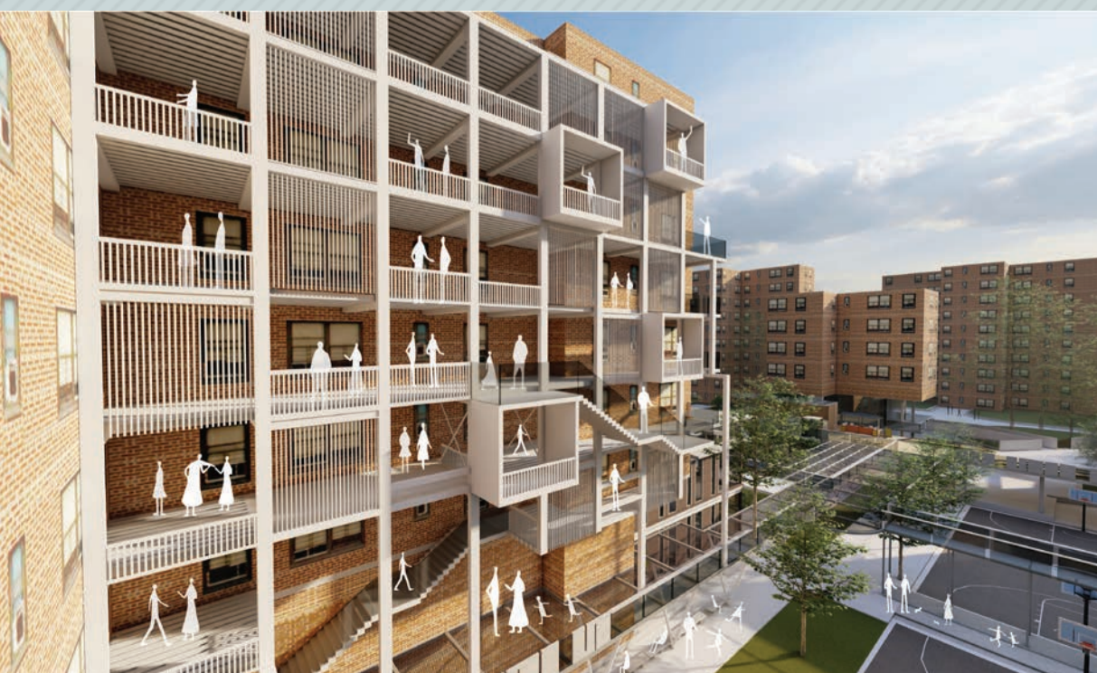
CONNECTION TO THE COURTYARD AND ELEVATED PLATFORM