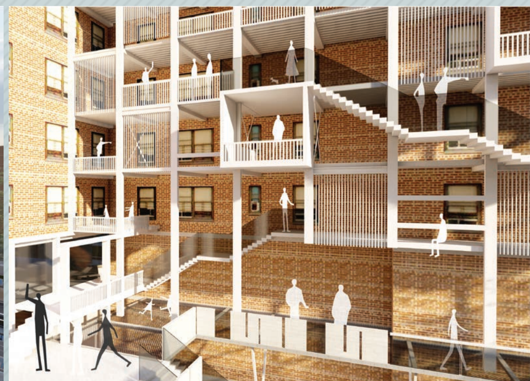
COMMUNITY GATHERING SPACES