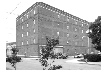
Former view of southeast corner

The project's high-contrast, canilevered addition with its shaped profile and orange accents makes an overt statement of the potential for a city's history to participate in its future.