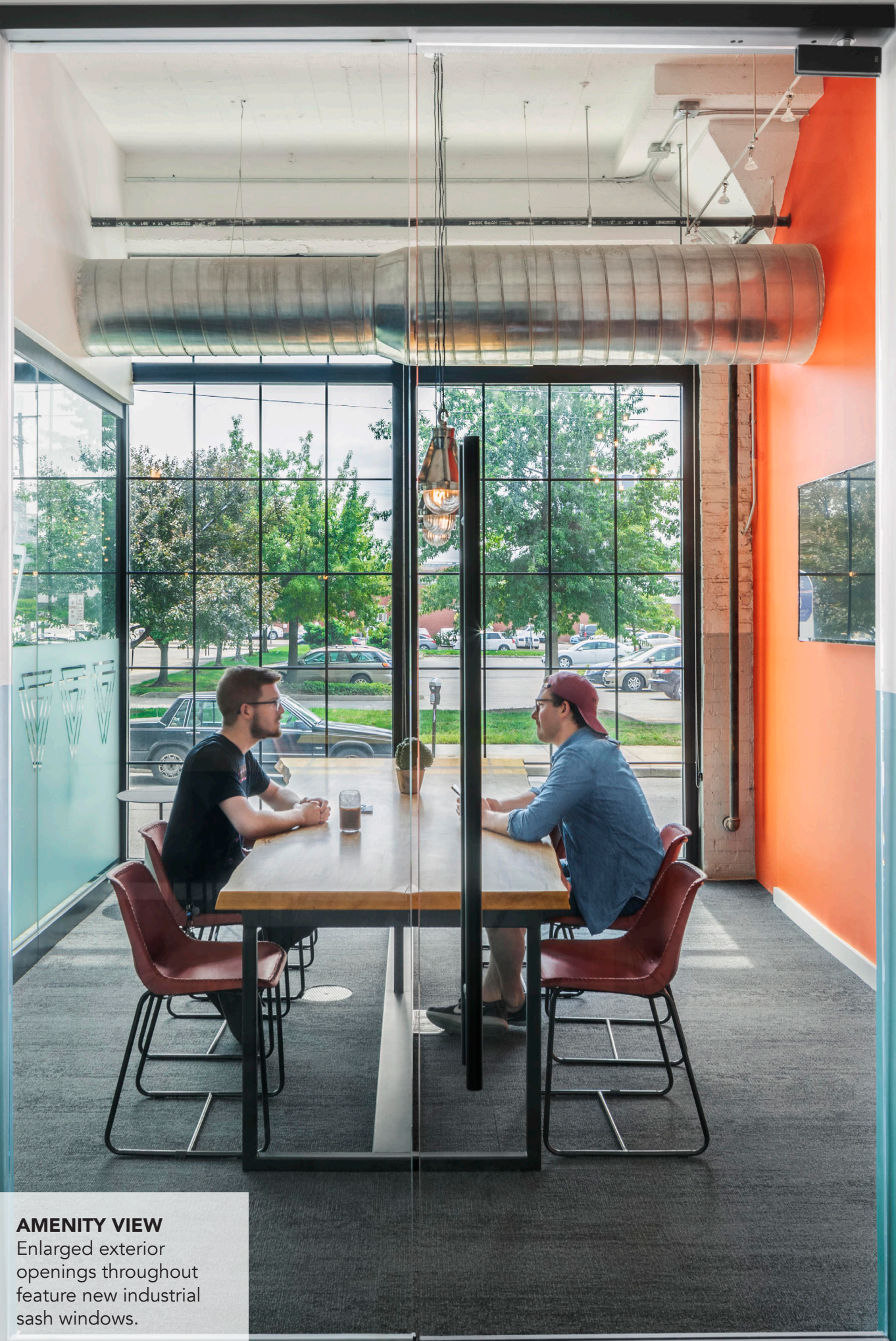
AMENITY VIEW Enlarged exterior openings throughout feature new industrial sash windows.