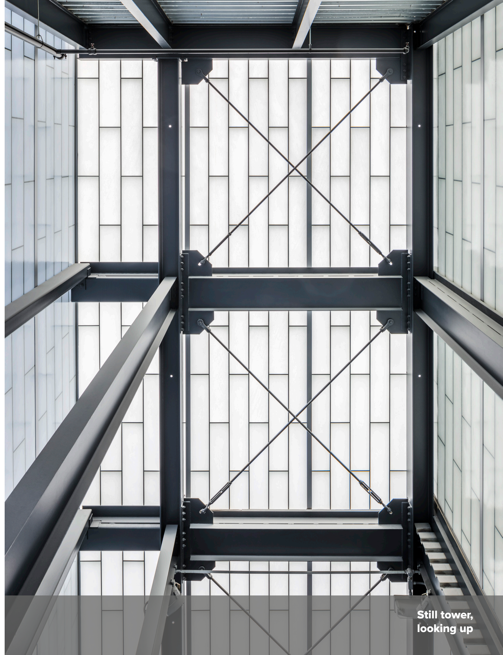
Still tower, looking up